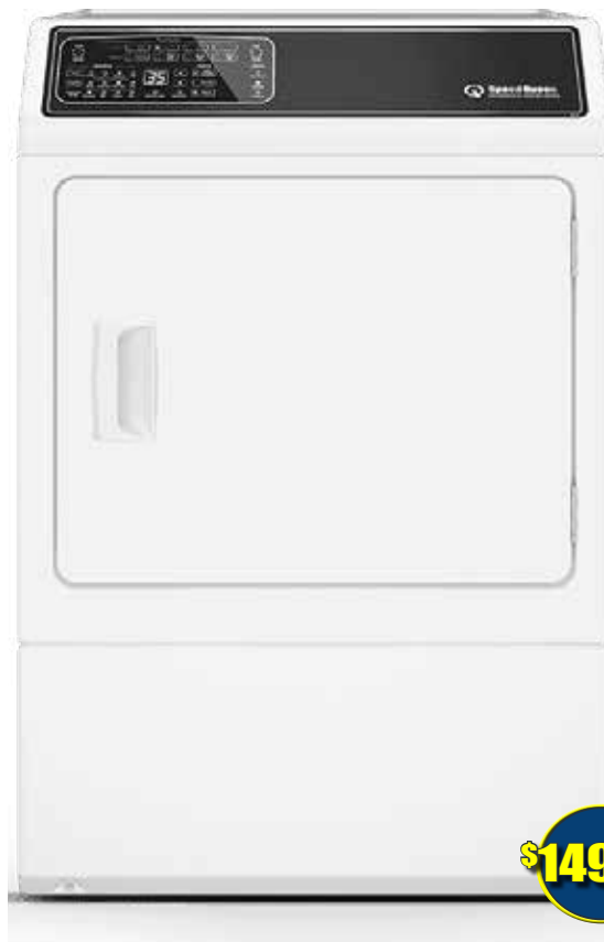
DF7000WE - Electric Dryer DF7003WG - Gas Dryer - $1563