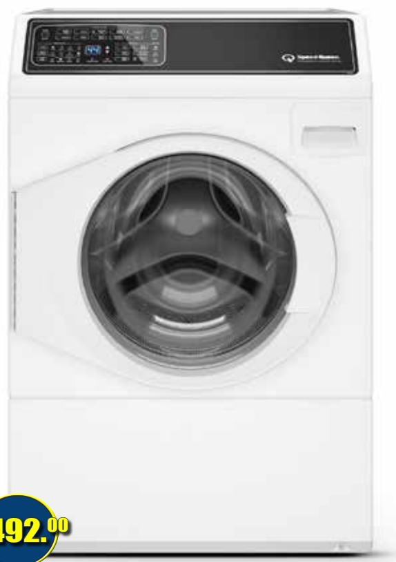
FF7005WN Frontload Washer