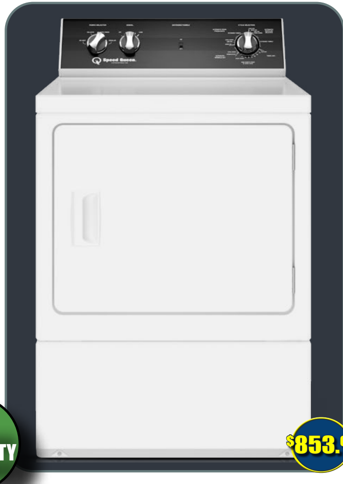
DR5003WE - Electric Dryer DR5003WG - Gas Dryer - $924