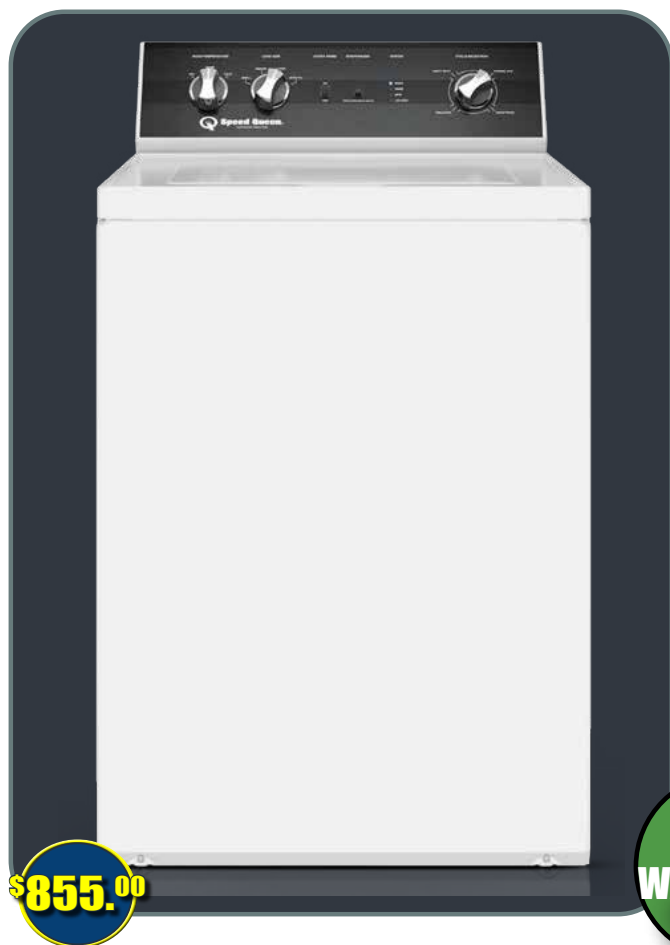
TR5003WN Washer 3.2CF