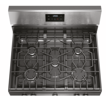
5.1 Cu. Ft. Oven Capacity

Moving heavy pots and pans across the cooktop is easier with continuous edge-to-edge grates.