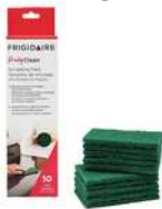
10FFSCRB01 ReadyClean™ Scrubbing Pads